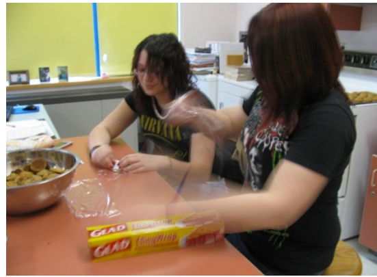
Juniors baked and wrapped cookies for the Meals on Wheels program.